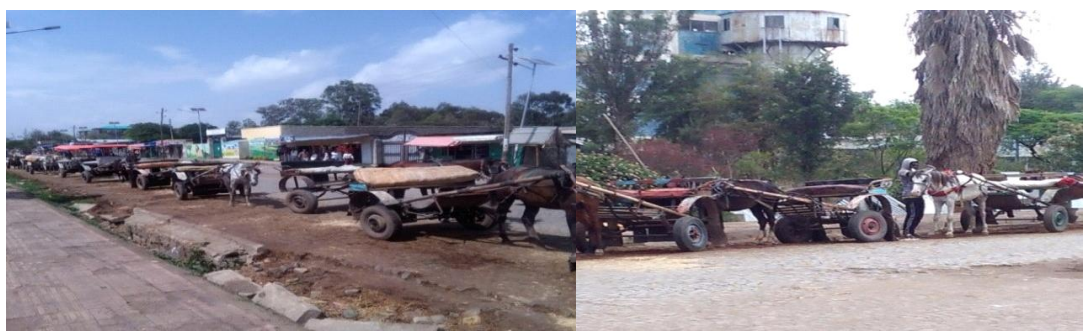
Figure 2: Turn of Carts / Horse transportation/ in Kurkura Danbi and Kajima Dibayyu administrations areas.