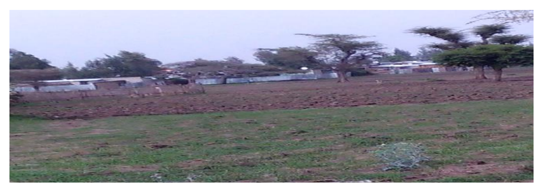
Figure 3: How agricultural land is grabbing by informal settlements

Besides, the data gathered through FGD and interview also revealed that the huge lands where informal settlers occupied today were used for different agricultural purposes before changed to settlements.